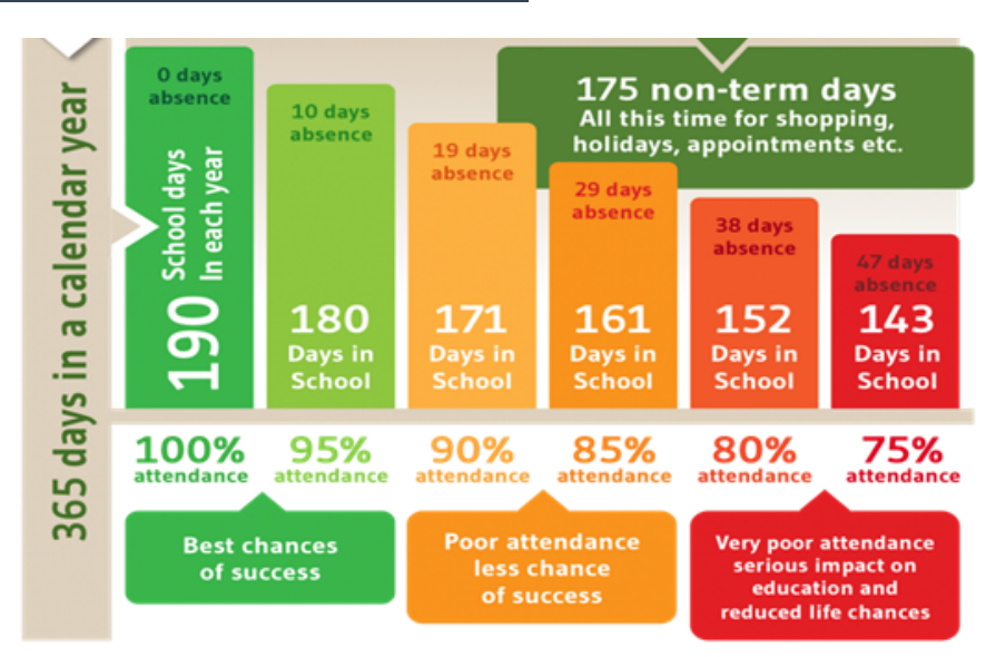
DID YOU KNOW? A two week holiday in term time means that the highest attendance you can achieve is 94.7%

Good attendance helps our children to learn the knowledge and skills vital to help them develop as successful learners academically, socially and emotionally.